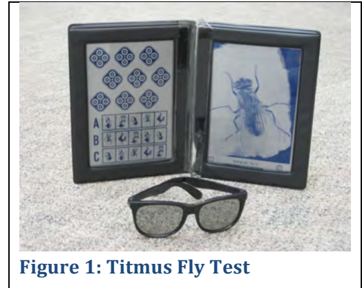
Figure 1: Titmus Fly Test