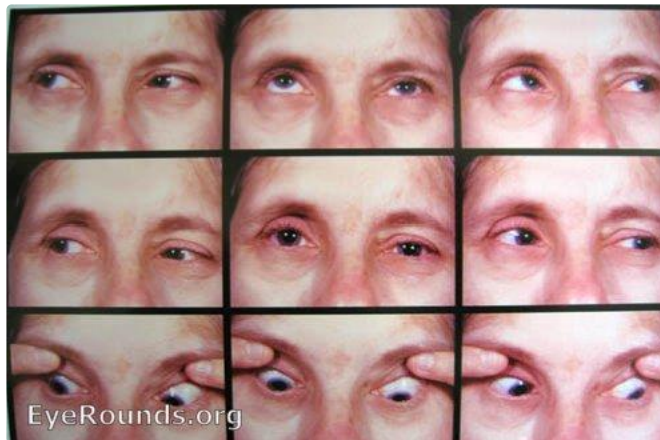
2) EOM showing restriction in upgaze OS